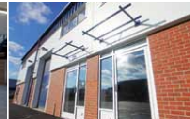
Indicative photos of similar scheme